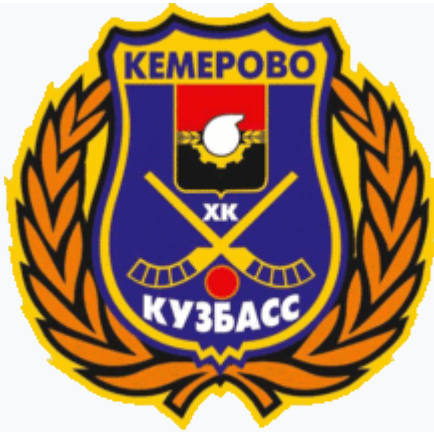
The Emblem of Bandy Club "Kuzbass" (Kemerovo)

Bandy is developed in Kemerovo. Competitions at various levels have place there. The world Championships was in 2007.